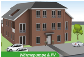
Wärmepumpe & PV